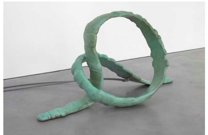
Nicolas Deshayes, Dear Polyp , 2016. Patinated bronze, hot water, 120 x 110 x 190 cm Courtesy the artist and Modern Art, London © Nicolas Deshayes