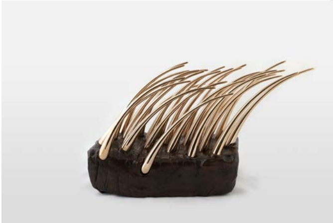
Nicolas Deshayes, Crop , 2020. Bronze, 20 x 41 x 26 cm. Edition of 5 (#1/5). Courtesy the artist and Modern Art, London. Photo Vincent Blesbois © Nicolas Deshayes

Le Grand Café - contemporary art centre is pleased to present Chambre froide , a solo show by Nicolas Deshayes, a young French artist trained in England where he now lives.